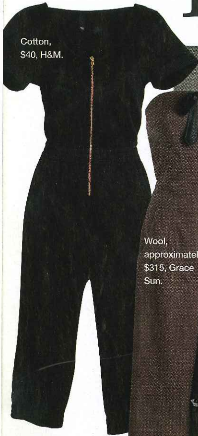
Cotton, $40, H&M.

Wool/polyamide-blend dress, $230, Dace. For where-to-buy, see Stylesource.