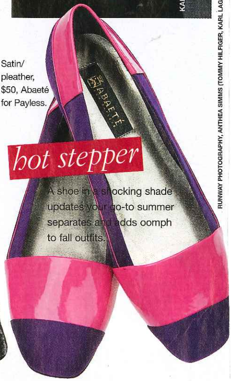
Satin/pleather, $50, Abaeté for Payless.