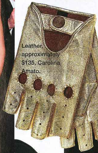
Leather, approximately $135, Carolina Amato.