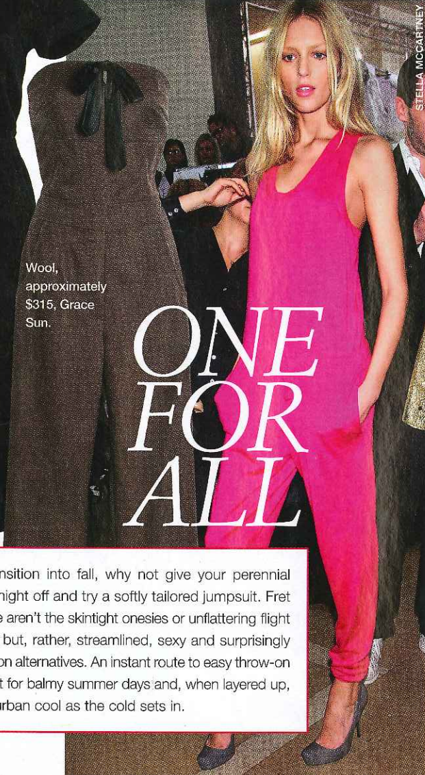
Wool, approximately $315, Grace Sun.