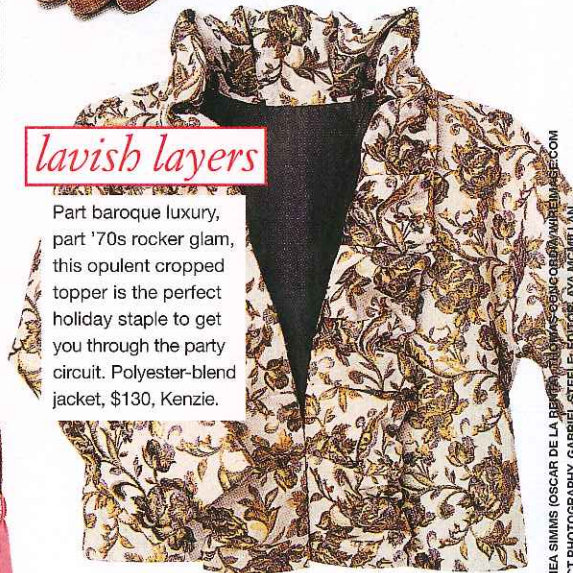
RUNWAY PHOTOGRAPHY, ANTHEA SIMMS (OSCAR DE LA RENTA); PHOTOGRAPHY, GABRIEL STIELE; EDITOR, JAYA MCMILLAN (MONIQUE LHULLIER); PRODUCT PHOTOGRAPHY, ANTHEA SIMMS

Part baroque luxury, part '70s rocker glam, this opulent cropped topper is the perfect holiday staple to get you through the party circuit. Polyester-blend jacket, $130, Kenzie.