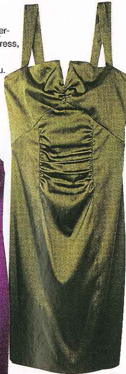
Polyester-blend dress, $90, Le Château.