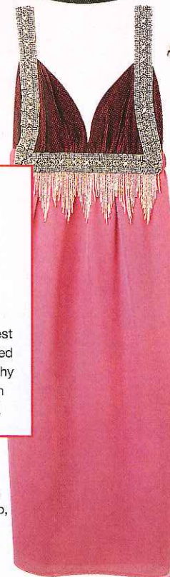
Rayon/silk dress, $595, Ingwa Melero, TNT Blu.

Give your LBD a break. Skin-flattering, eye-catching jewel-toned confections ensure you'll get everyone's vote for best dressed. Similar stylish frocks in burnished hues (ruby, emerald and red-carpet-worthy amethyst) round out the colour wheel in dramatic fashion. Colour us impressed.