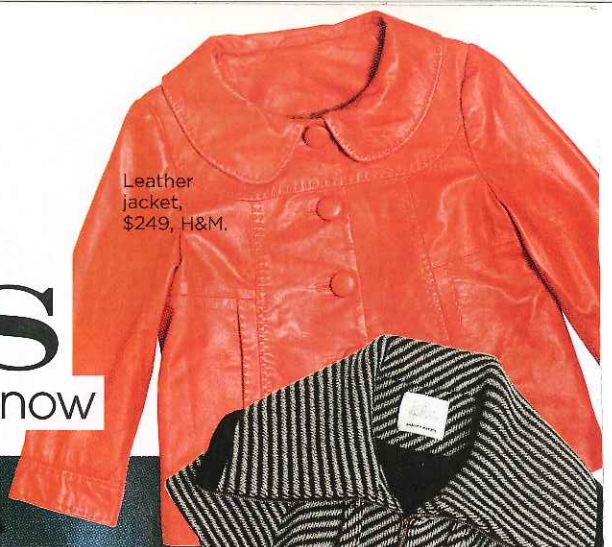
Leather jacket, $249, H&M.

Big, bold and budget-friendly, this luxe-looking timepiece is more than just a pretty face. Stainless steel, $315, Michael Kors.