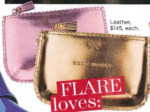
Leather, $145, each.