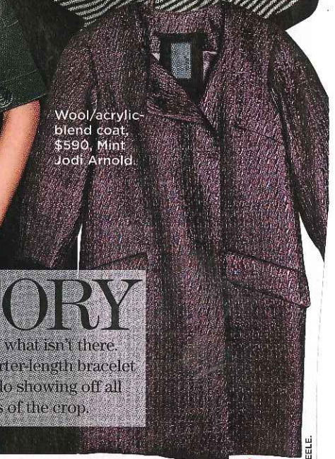
Wool/acrylic blend coat, $590, Mint Jodi Arnold.