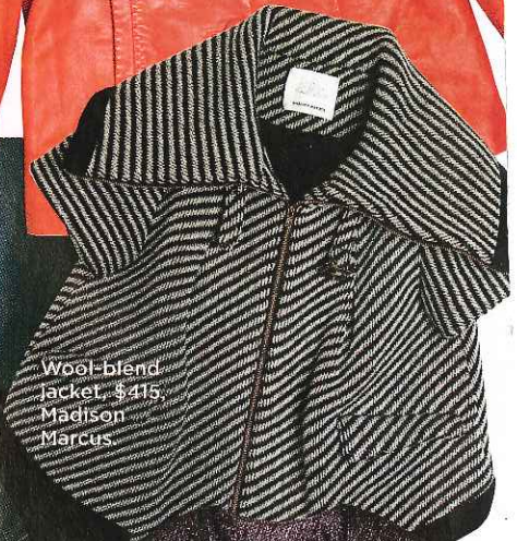
Wool-blend jacket, $415, Madison Marcus.