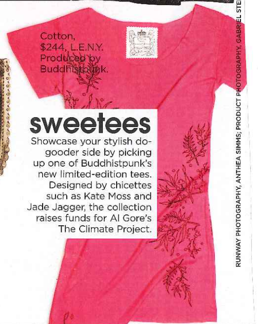
Cotton, $244, L.E.N.Y.

Anya Hindmarch's loose pockets. Embossed with cheeky slogans such as Face Repair Kit and Bits & Bobs, the clever cases are a fun way to organize your "girlie stuff" inside fall's mammoth carryalls.