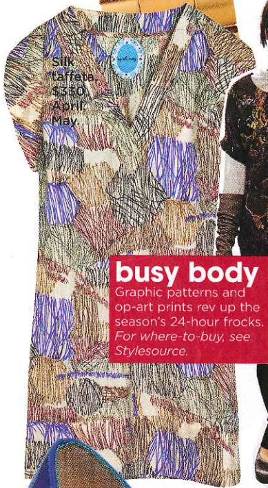
Silk taffeta, $350, April May