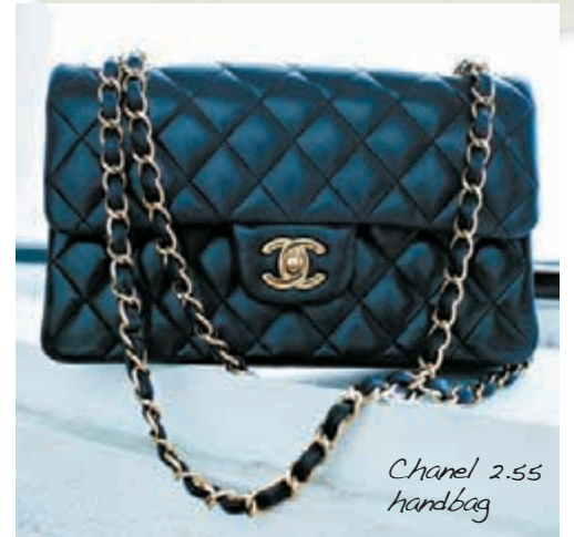
Chanel 2.55 handbag