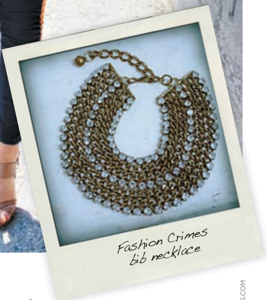
Fashion Crimes bib necklace

Necklace: Expressions exclusive to The Bay Jacket: Zara Pants: Hudson Blouse: Cos Shoes: Ash Bag: Yves Saint Laurent Watch: Marc Ecko Jewellery: Tiffany & Co., Links of London, Topshop, Forever 21, J.Crew, vintage ring