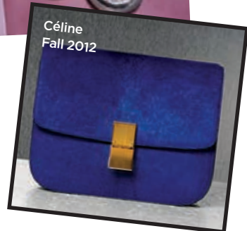
Céline Fall 2012