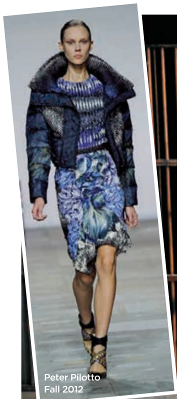
Peter Pilotto Fall 2012