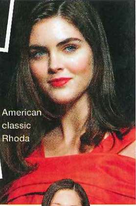
American classic Rhoda