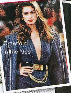
Crawford in the '90s