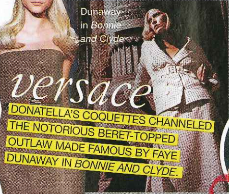
Dunaway in Bonnie and Clyde

versace DONATELLA'S COQUETTES CHANNLED THE NOTORIOUS BERET-TOPPED OUTLAW MADE FAMOUS BY FAYE DUNAWAY IN BONNIE AND CLYDE .