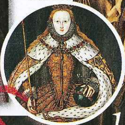
Queen Elizabeth I circa 1559

rodarte The Mulleavy sisters proved to be loyal subjects, as Queen Elizabeth I held court.