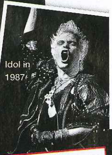
Idol in 1987

Hit girl Hilary Rhoda is the gorgeous reincarnate of Cindy Crawford, while Agyness Deyn exudes a punky originality that's got everyone rebellious for Billy Idol.