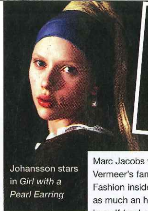
Johansson stars in Girl with a Pearl Earring