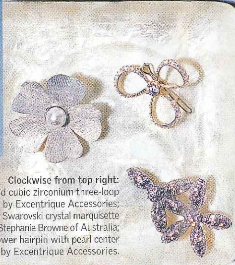
Clockwise from top right: Sterling-silver and cubic zirconium three-loop barrette ($175), by Excentrique Accessories; Silvana rhodium and Swarovski crystal marquissette hair brooch ($135), by Stephanie Browne of Australia; sterling-silver flower hairpin with pearl center ($165), by Excentrique Accessories.