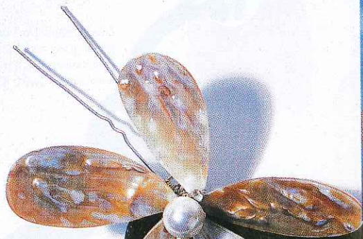
Clockwise from top: Mother-of-pearl flower hairpin with pearl center ($600), by Excentrique Accessories; Diamond Daisy freshwater pearl spray hairpin with sterling-silver wire and Swarovski crystals ($98 for set of three), by Haute Bride; True Love clear hairpin with pearls and crystals ($120), by Debra Moreland for Paris.

Down the runways and up the aisles, the prettiest bridal looks include dos with just a dab of dazzle.