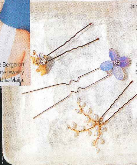
From top: Gold/mocha foliage hairpins ($145 for mixed set of 10), from the Bobby Bouquet Hairpins Collection by Laura Jayne Bridal Design; blue chalcodony flower hairpin ($75), by Excentrique Accessories; white and peacock freshwater pearl spray hairpin ($72 for set of three), by Johanna Forbes Designs.