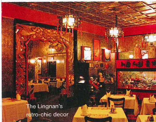
The Lingnan's retro-chic decor