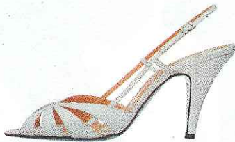
You'll wear these again and again: white leather crisscross slingback ($360), by Jean-Michel Cazabat.