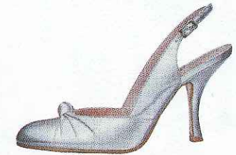
Perfect for a vintage '20s or '30s look: silver round-toe slingback ($79), by Enzo Angiolini.