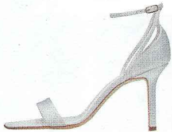
The best very simple look: white satin single-band sandal ($275), by Calvin Klein.