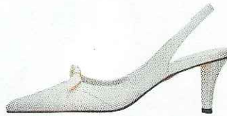
When you want heels but need comfort: white satin pointy-toe slingback ($89), by Nine West.