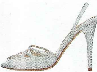
When you want something sexy yet elegant: white silk crisscross slingback sandal ($395), by Badgley Mischka.