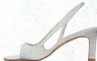
When you want a dyeable option: white silk satin open-toe slingback with medium heel ($159), by Entrata.