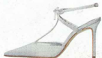
The chicest Audrey Hepburn-style shoe: white satin T-strap slingback ($325), by Christian Lacroix.