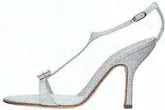
Ultramodern but still feminine: white silk satin T-strap sandal ($400), by Vera Wang.

Your sole searching is over. Here are the best shoes in the hottest looks: strappy, round-toed, super-pointy, crystal-covered and colored metallic.