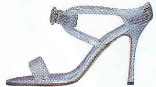
For a dress with understated elegance, here's the wow factor: silver lizard sandal ($865), by Manolo Blahnik.