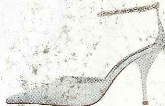
The ultimate closed-toe pump: white satin pointy-toe stiletto with jeweled strap ($295), by Constança Basto. ♥

For shopping information, see the Shopping Guide at the back of this issue.