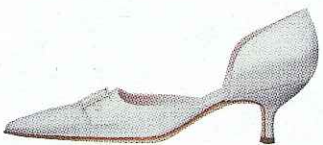
Perfect with a suit at a civil ceremony: white silk satin d'Orsay kitten-heel pump ($400), by Vera Wang.