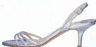
When you want sexy and strappy but can't do high heels: silver leather slingback sandal ($435), by Jimmy Choo.