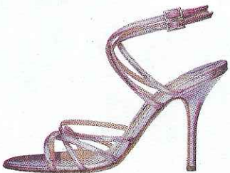
For a shot of sweet color: pink leather strappy sandal ($520), by Jimmy Choo.