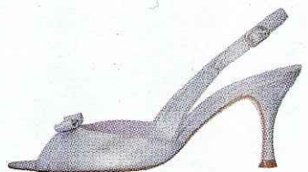
Quirky but still very cute: silver metallic suede slingback with embroidery ($280), by Lulu Guinness.